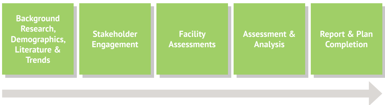
Figure 1: Project Stages