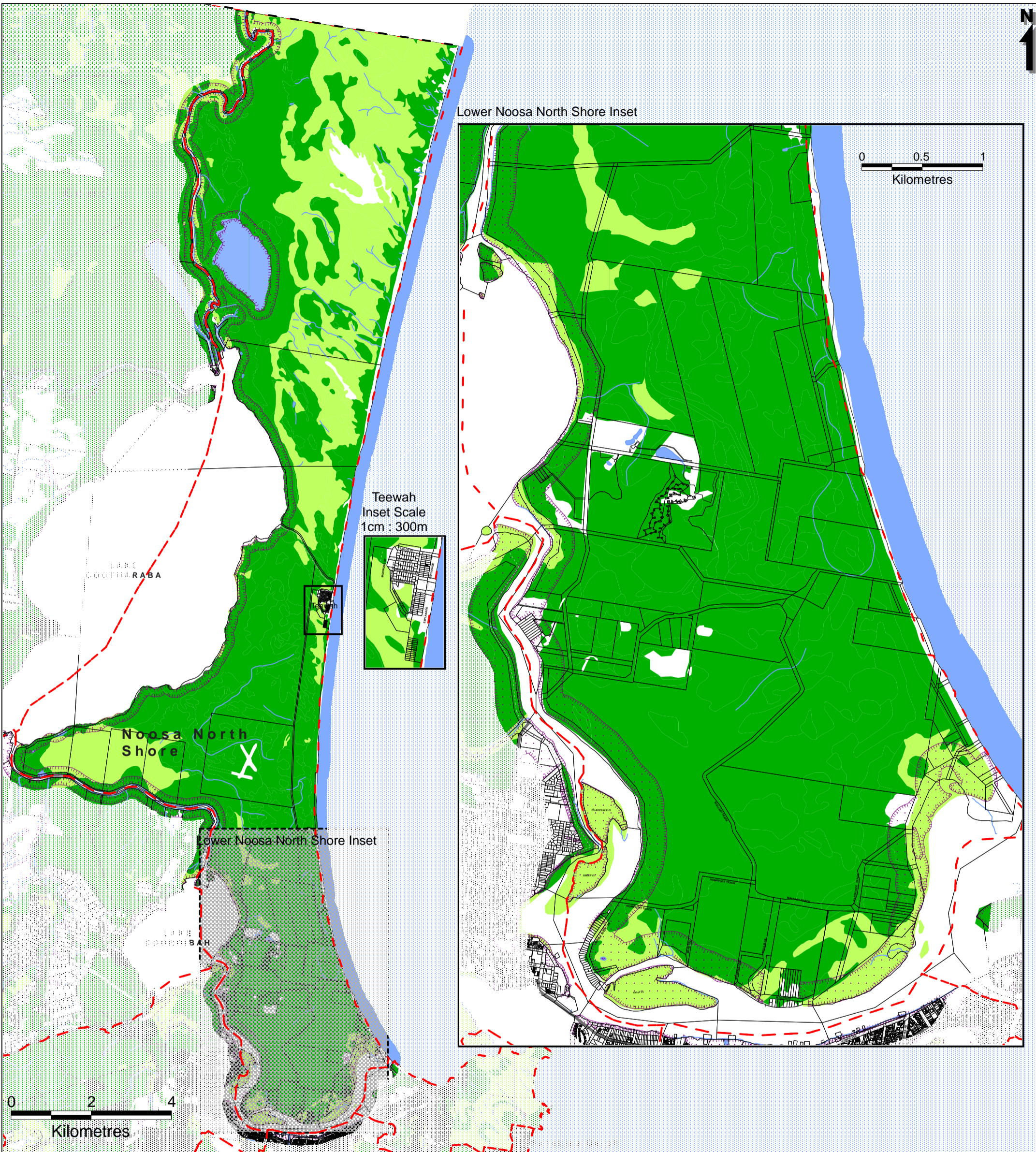
Lower Noosa North Shore Inset