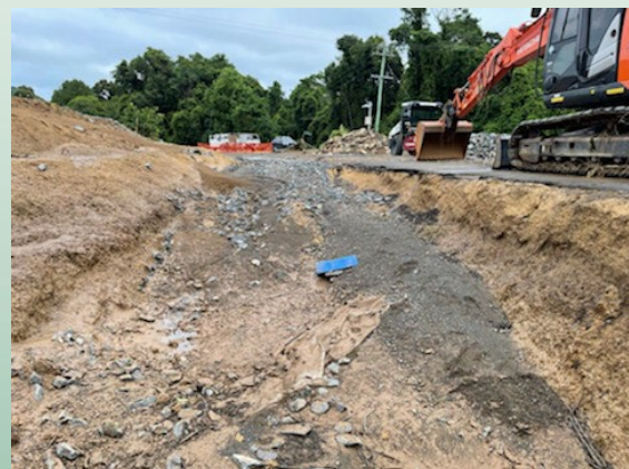
Damage to construction

Council acknowledges the impact these delays will have for the community. We are committed to keeping residents and motorists informed and will provide an update about the status of work as soon as this information becomes available.