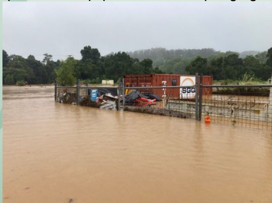
SGQ site including container and vehicle

Construction equipment worth millions – both SGQ's and subcontractors' – was also destroyed. While it is anticipated most equipment can be replaced with relative ease, it will be more difficult to replace some of the more specialised equipment, such as piling rigs.