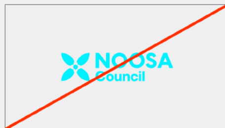
Don't use unapproved colours