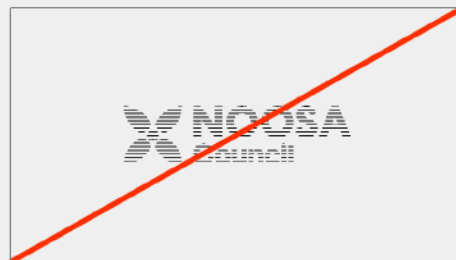
Don't apply patterns