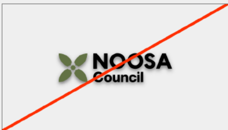
Don't apply shadows or effects