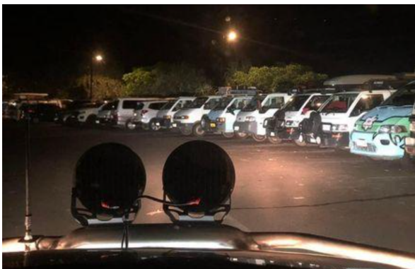
Image: Illegal campers at Noosa Woods

The overnight 'No Parking' strategy, which is inline with the approach other local government areas are adopting to address illegal camping, will give Local Laws Officers additional avenues to generate compliance with local laws. Police will also be able to enforce the 'No Parking' signs if they are called to Noosa Woods to deal with anti-social behaviour during the night.