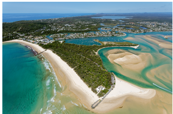
Image: Beautiful Noosa Spit Recreation Reserve

If you have any further questions or would like to provide feedback regarding this trial please contact Noosa Council.