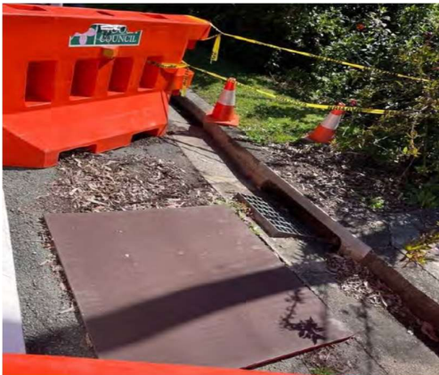
Damaged stormwater area

The Project team has now completed the necessary engineering and design work and awarded the construction contract.