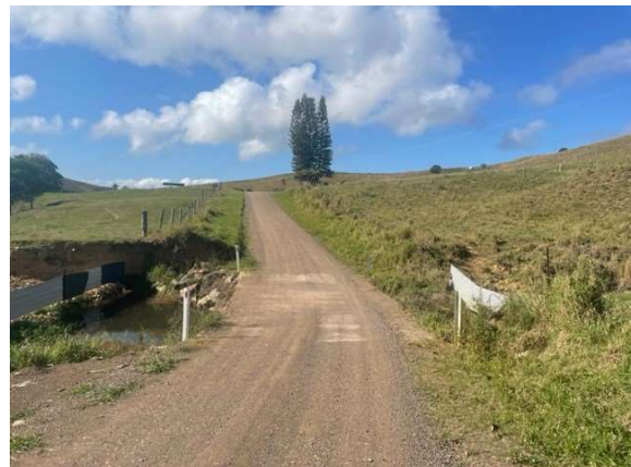
Damaged culvert near #363

The flood recovery effort for Noosa Council is jointly funded by the Commonwealth-State Disaster Recovery Funding Arrangements.