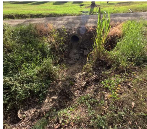
Damaged culvert nearby #88

Works will result in some traffic disruptions. Side-tracks will be constructed near the sites to allow for continued traffic access. Traffic control will also be used at times to stop motorists for short periods. Please ensure all traffic signs and instructions are followed to ensure the safety of all road users and construction workers.