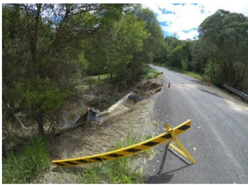
Damaged culvert near Schreibers Road and Coles Creek Road.

The construction program will include the use of heavy machinery, delivery of materials, demolition and concreting works.