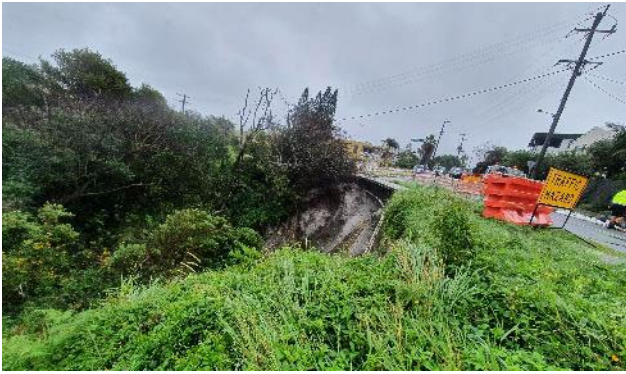
Slope damage at intersection