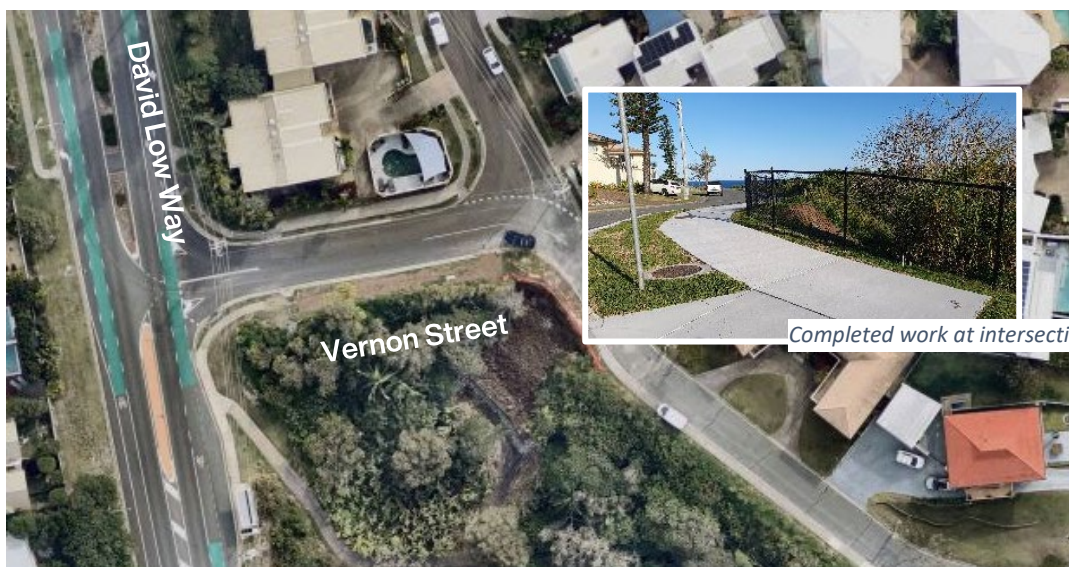
Location of damage at the intersection of Vernon and Sobraon streets

Assistance to deliver this resilience project was provided through the jointly funded Commonwealth-State Disaster Recovery Funding Arrangements (DRFA).