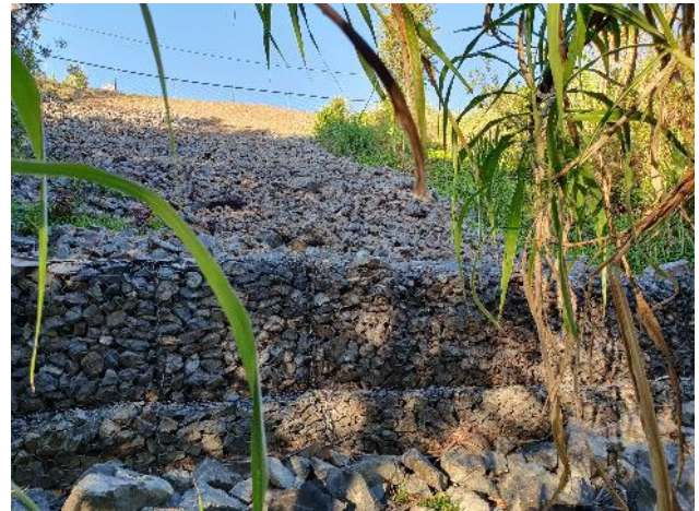
Completed slope remediation from bottom of slope