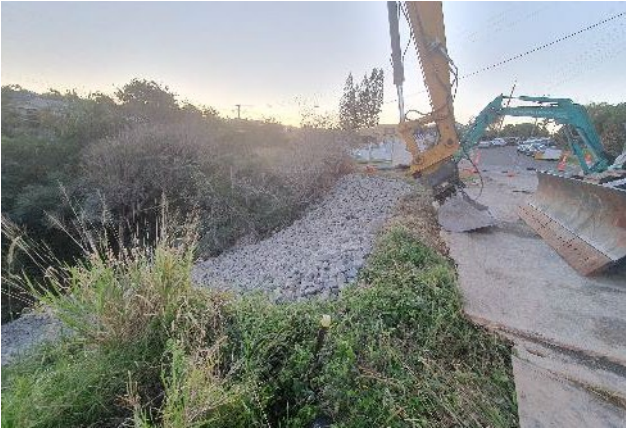
Gabion and rock fill during construction