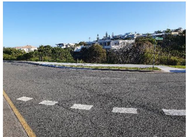
Completed work at intersection