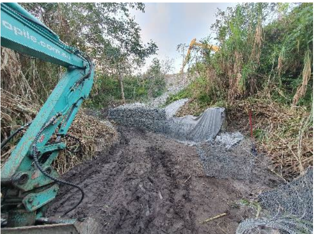
Gabion and rock fill at bottom of slope during construction