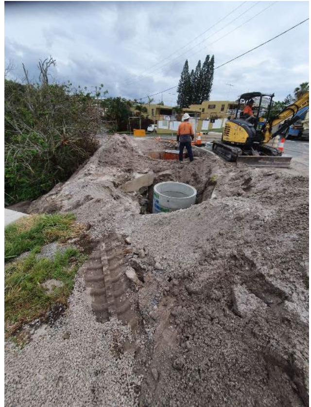
Stormwater repairs underway