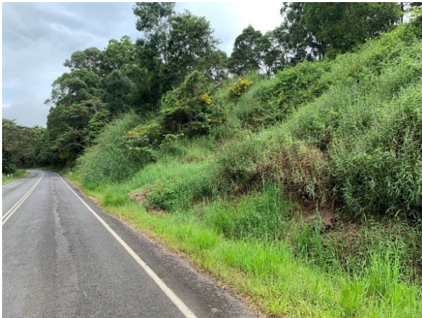
Landslide above 490 Cooroy-Belli Creek Road

FKG Civil Pty Ltd (FKG) has been awarded the contract to undertake works near 490 Cooroy-Belli Creek Road. The construction will repair landslide damage on the upslope and downslope of the road.