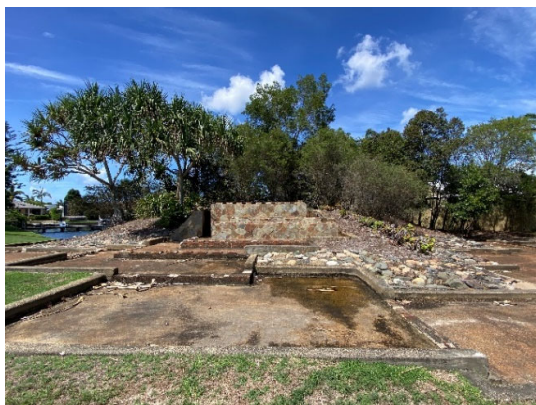
IMAGE: Current Noosa Waters Entry Statement

To ensure a high-quality renovation, Council has contracted Disc Landscaping, an experienced landscape construction company, to undertake this work.