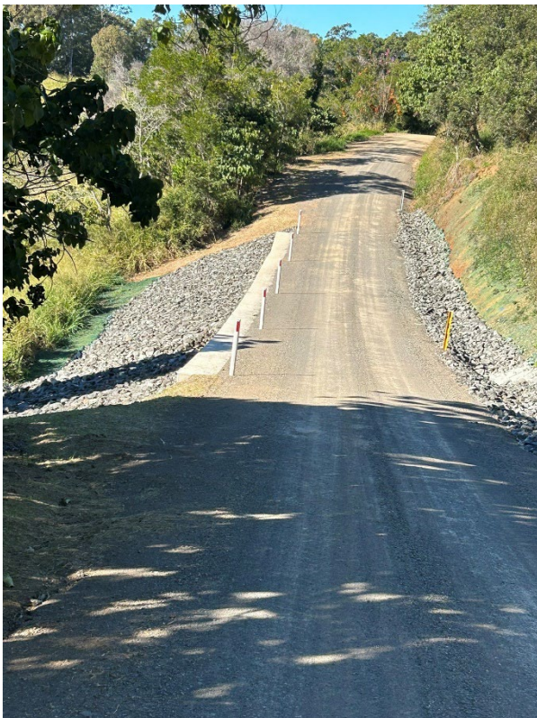
Completed works on Simpsons Road - July 2024

Council would like to thank Simpsons Road residents for their patience and co-operation during these works.