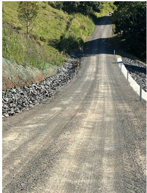
Completed works on Simpsons Road - July 2024