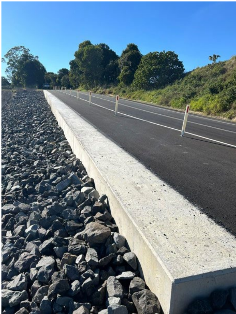
Completed works on Cootharaba Road - July 2024