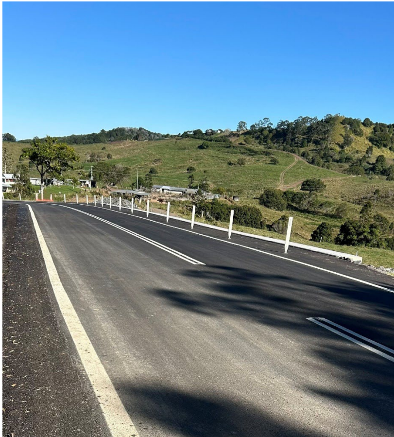
Completed works on Cootharaba Road - July 2024