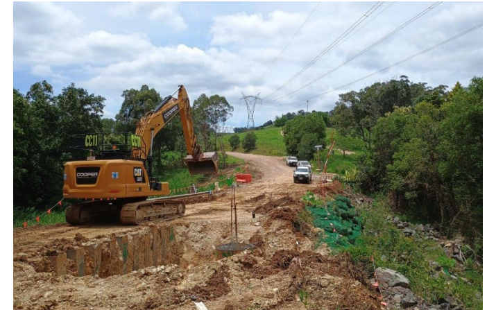
Construction underway on Schreibers Road.