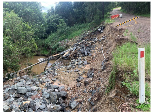
Damage to Schreibers Road

Council appreciates the ongoing patience and support from the community as the reconstruction program continues.