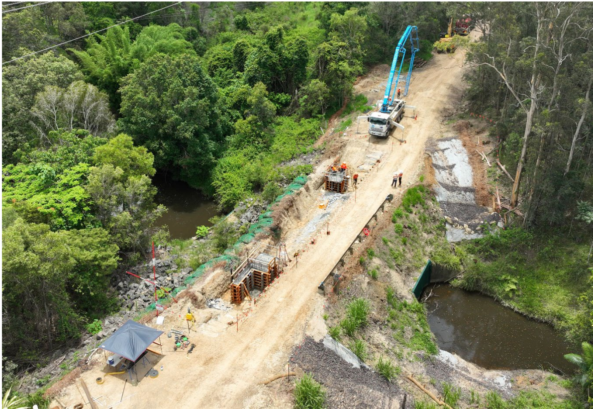
Drone footage showing progress at the end of November.