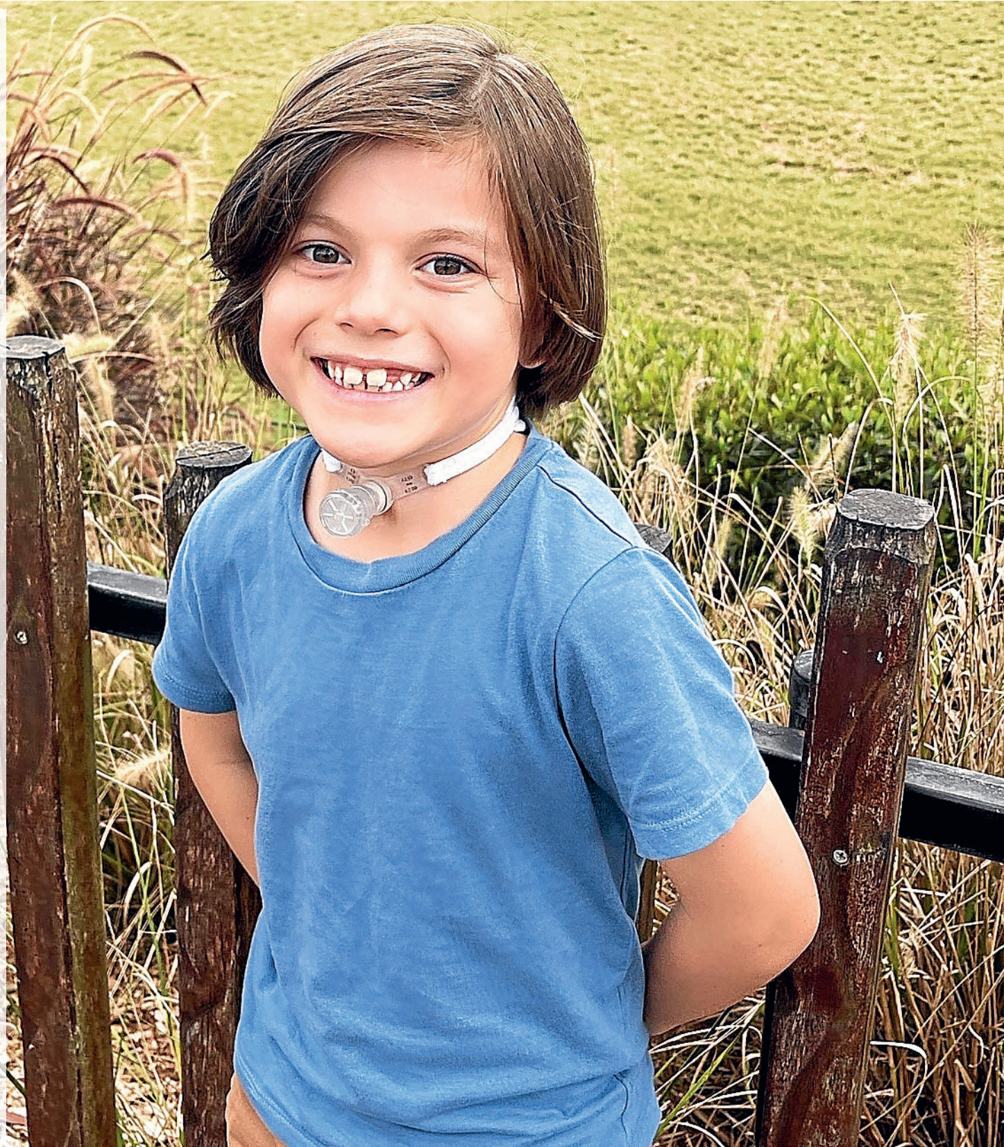
Fun loving and energetic Archer.

For more information, visit Council's website - noosa.qld.gov.au .