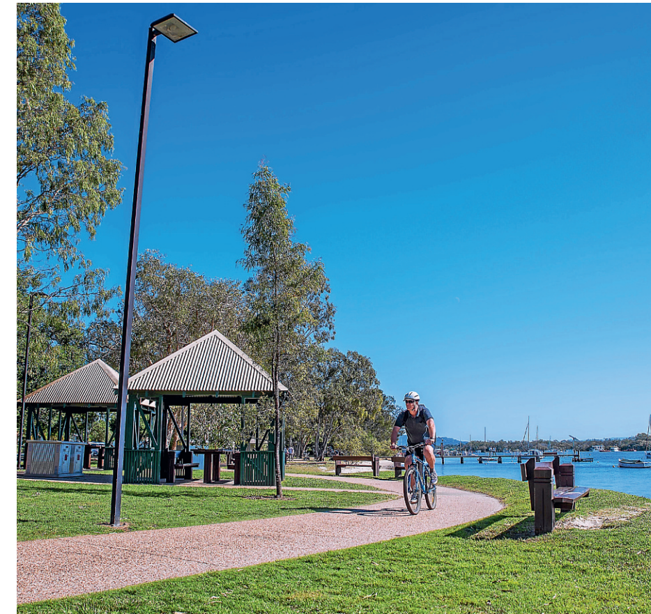
The draft plan and online survey are available at yoursay.noosa.qld.gov.au before July 7.

Council's new Infrastructure Master Plan provides a visionary blueprint for renewing Noosaville's popular foreshore.