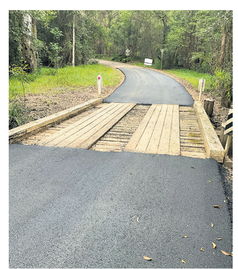
McCabes Road bridge

Crews resealed and asphalt patched a section of Blueberry Drive in Cudgerie Estate, Black Mountain.